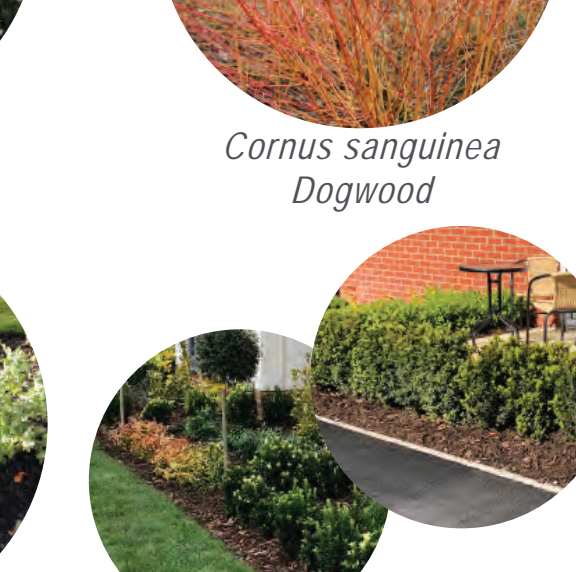
Ilex crenata or Laurus nobilis