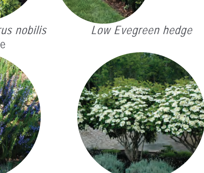
Viburnum opulus 'Compactum'