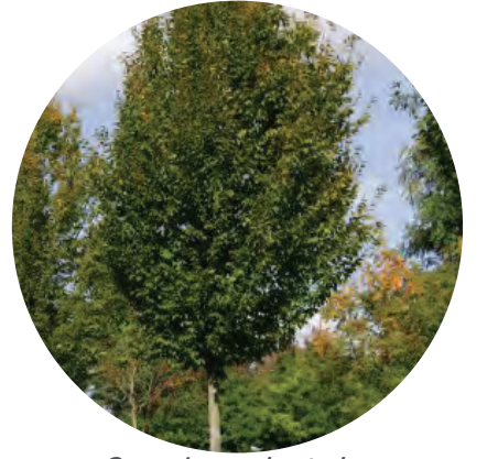
Carpinus betulus Betula pendula Evergreen trees will provide year round visual mitigation and support local biodiversity

Native trees on the southern boundary will provide visual mitigation and support local biodiversity