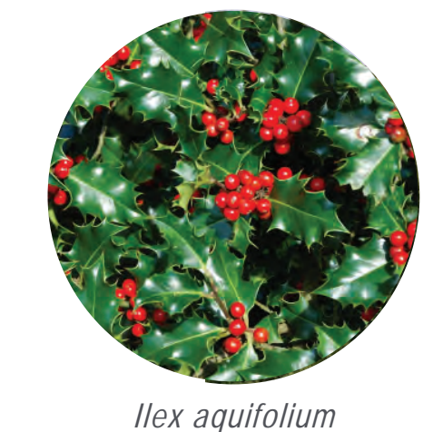
Ornamental trees within the amenity areas will add vertical seasonal interest to the shrub beds throughout the development.